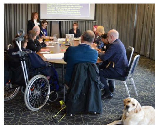
Our 2019 Annual General Meeting and Conference in Dundee on the 30 October 2019.