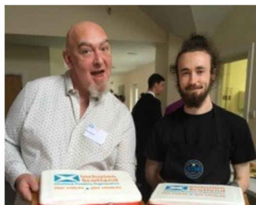
Our Annual Highland Summit in Inverness on 5 July 2019