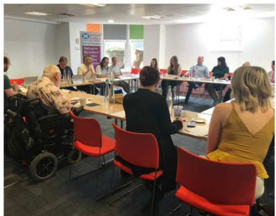
Our Pop Up Think Tank "Friend of Foe" on Basic Income on 25 July 2019