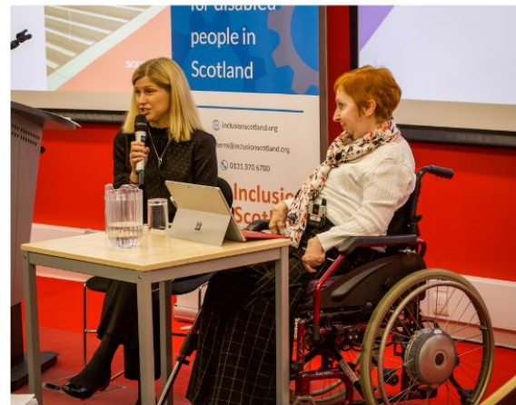
"The Future Is Accessible 2019" on the 3 December 2019 at Queen Margaret University