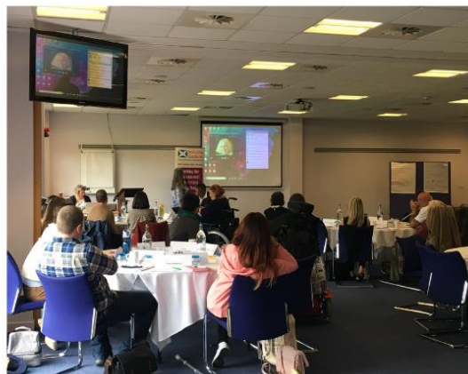
The final meeting of the pilot phase of the People-Led Policy Panel on Health and Social Care Support in Stirling on the 4 June 2019